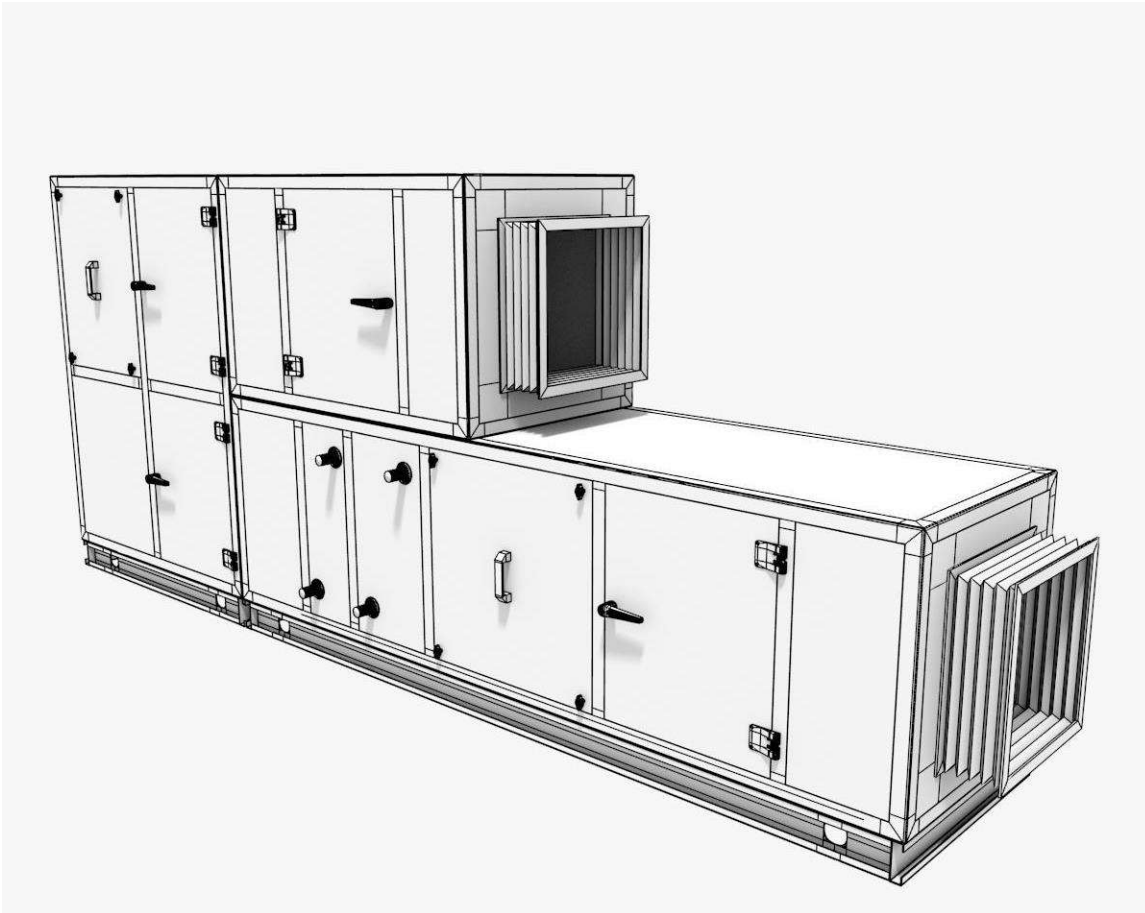
Schematic drawing of a typical AHU