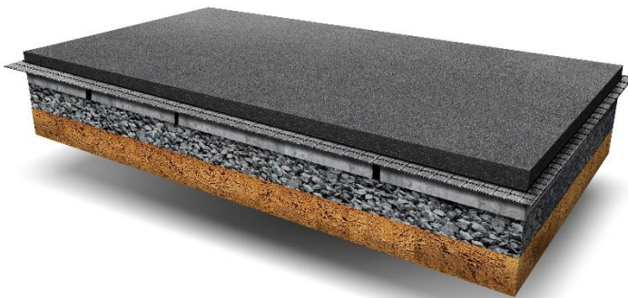
Figure 1: Asphalt pavement with HaTelit® (second top layer)